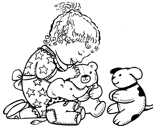
God Hears and Answers Prayers